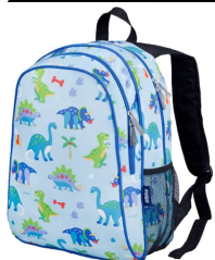
Backpack (big enough to fit a 9 x 12 folder & NO wheels or luggage)

SUPPLIES PROVIDED BY THE TEACHER - Pencil Sharpeners, Erasers, Scissors, Folders, Rulers (no need to purchase)