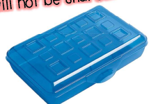
Plastic Pencil Box (5 x 8 in size)

ALL supplies will be for the individual child, they will not be shared.