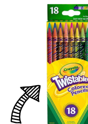
1 pack of Crayola 18 count Twistables Colored Pencils