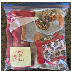
A change of clothing, uniform style with socks & underwear, in a Ziploc bag to be left in your kinder's backpack AT ALL TIMES