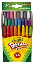
1 pack of 24 count Twistables Crayons (We suggest Crayola)