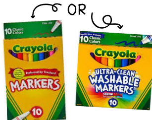
1 pack of markers (We suggest Crayola either fat OR thin washable markers)