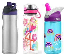
Water Bottle (consider a leak-proof one that can hold 200z or more)

* Bonus points for backpacks with side pockets for water bottles